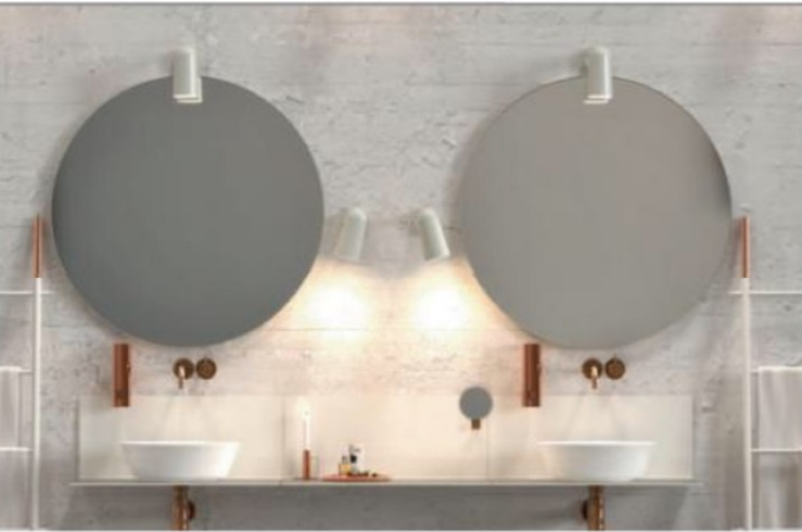
FROST Unu Wash Table

The Unu Wash Table from Frost can be customised according to specified drawings, while laser cuttings for pipes and mixers are also available on request. Featuring a shelf load of 80kg, the table is complemented by the brand's Round Mirrors, which feature slender-edged profiles and are powder-coated in black or white. The Nova2 bathroom accessories, meanwhile, have been designed by Bønnelycke MDD and come in six finishes including original copper, modern gold and pure white.