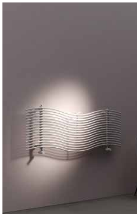
STANDARD HYDRAULIC VERSION (Connectors OB1)